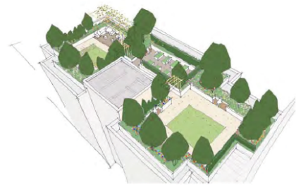
Axonometric view of 8th floor roof garden Block B