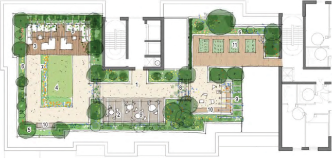
Plan of Roof Garden at West Wing