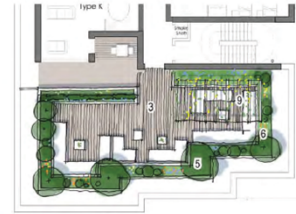
Plan of Roof Garden at East Wing