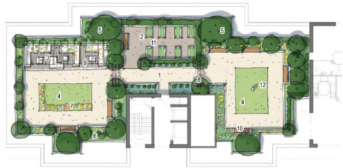
Plan of 8th floor Roof Garden Block B