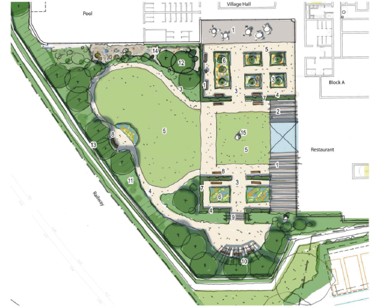
Plan of Courtyard Garden