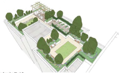
Axonometric view of 6th floor roof garden Block B