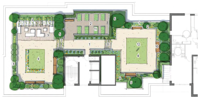
Plan of 6th Floor Roof Garden Block B